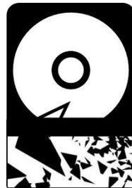
Step 2: Destruction