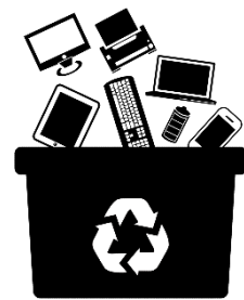
Step 3: Disposal